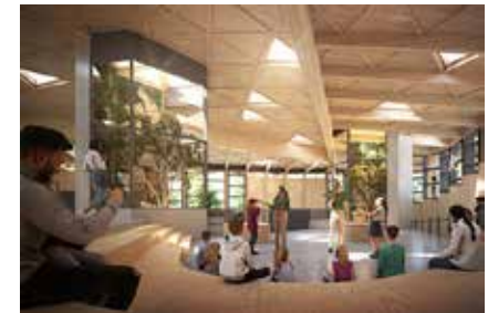
Trailhead Pavilion Interior

About the Organization: Woodland Park Zoo’s mission is to save wildlife and inspire everyone to make conservation a priority in their lives. Established in 1899, Woodland Park Zoo has gathered generations of people together to enjoy a 92-acre urban oasis, connect with animals, and experience a sense of wonder and discovery. The zoo welcomes nearly 1.3 million guests each year and is committed to expanding access for those with barriers to visiting, offering highly reduced-price tickets and memberships for a variety of audiences. Through our Community Access Program (CAP), one of the largest access programs of any cultural organization in Washington state, the zoo partners with more than 450 local human service organizations across Puget Sound to provide more than 100,000 complimentary zoo passes annually. As a visible and valuable community institution, the zoo attracts visitors who create a significant revenue impact for our local community and Washington state. In addition, the zoo stimulates economic activity in the surrounding region by providing jobs through our ongoing business operations and business partnerships.