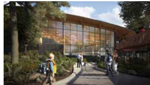
Trailhead Pavilion Exterior

About the Project: Woodland Park Zoo is building a new Forest Trailhead exhibit at the center of our 92-acre campus that will bring animals and people together under the canopy of the global forests we all share. The exhibit will feature a two-story, 14,200 square foot Trailhead Pavilion, constructed from sustainable materials, that will house a Community Conservation Gallery, Central Plaza and Habitat Gallery, as well as staff workspaces, a public restroom, storage and mechanical rooms, visitor pathways and ADA-accessible sloped walkways. Through the Trailhead Pavilion—and the larger Forest Trailhead exhibit—Woodland Park Zoo will provide storytelling through art and interactive experiences embedded in the cultural context of our local and global communities, focusing on how people around the world are already making a difference for forests.