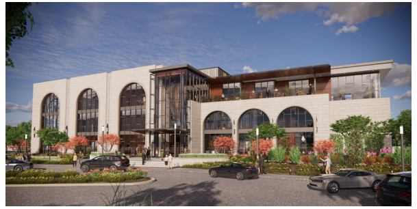
Photo credits, from left to right: Seattle Children's Theatre, rendering by ORA; Imagine Children's Museum; Idaho Central Spokane Valley Performing Arts Center, rendering by NAC Architects